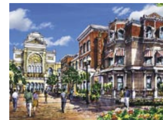
PICTURED ABOVE, TOP TO BOTTOM: Pinnacle Lumiere Place in downtown St. Louis City, exterior rendering; Pinnacle River City complex in St. Louis County, exterior rendering.